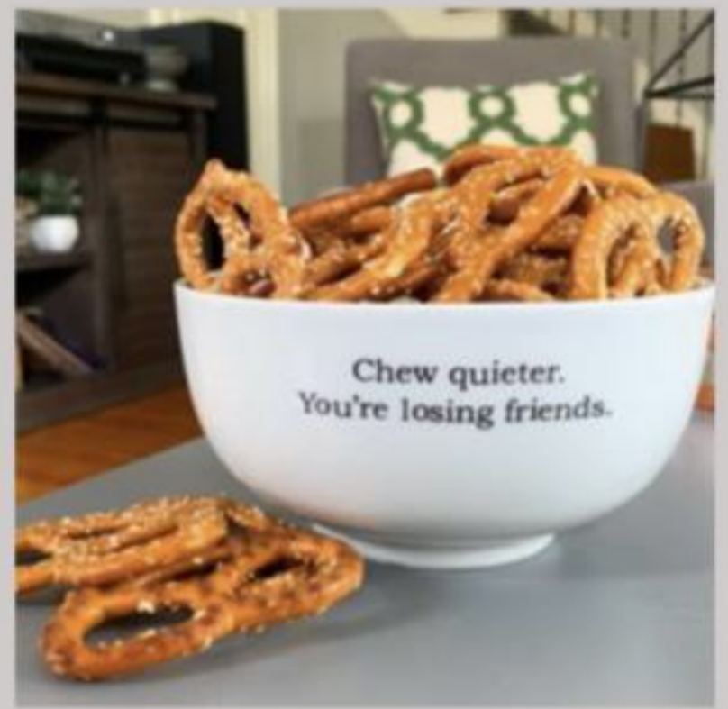
Chew Quieter, You're Losing Friends BOWL-008