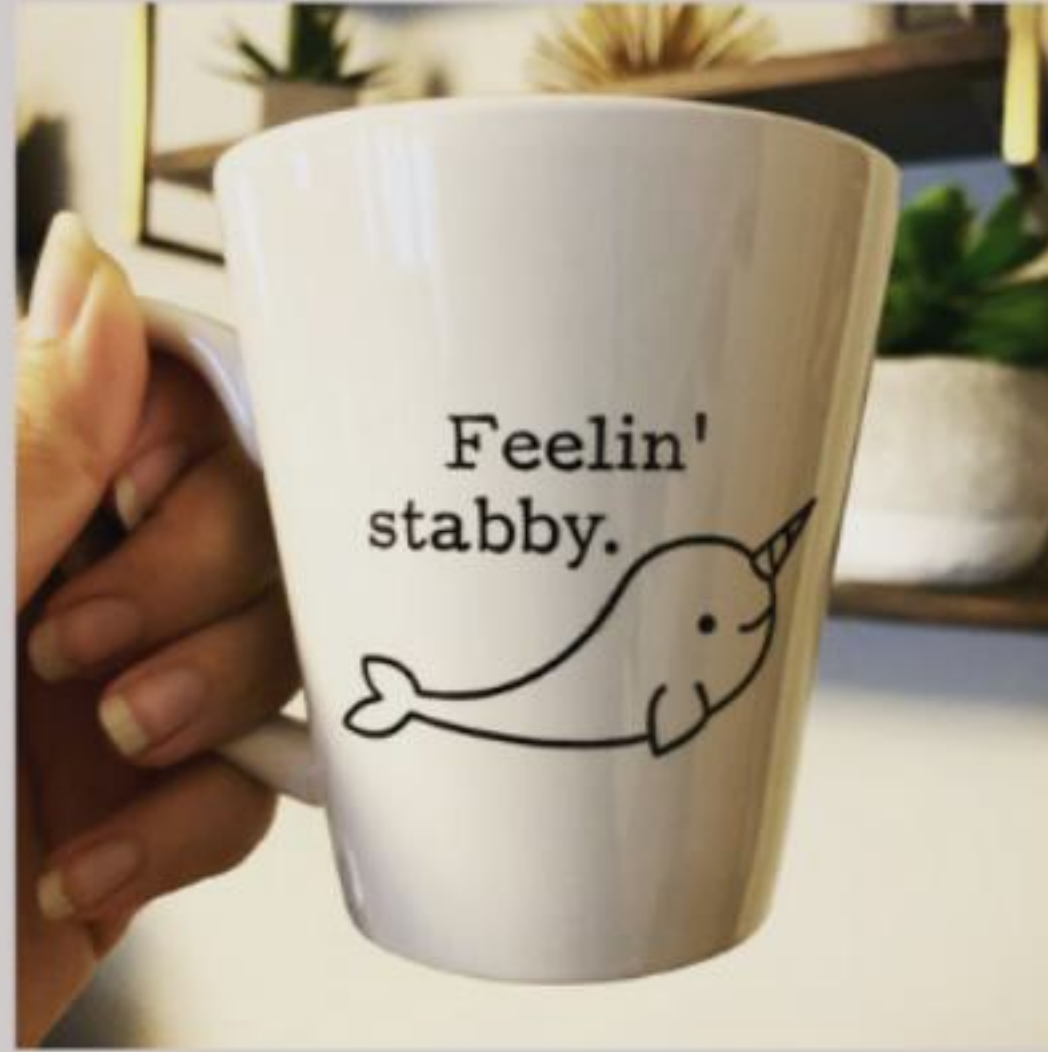
Feelin' Stabby MUG-076