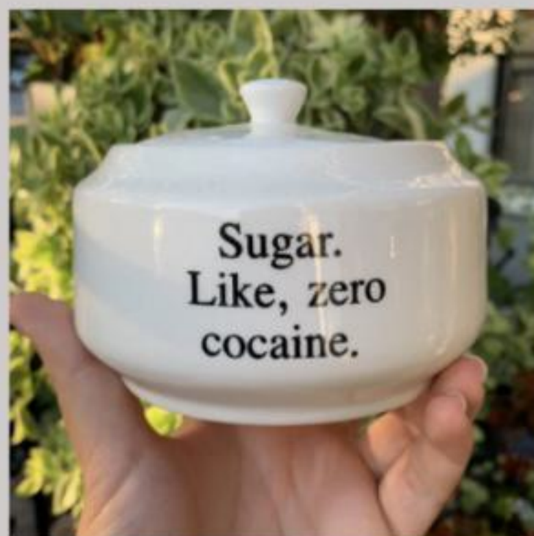
Like, Zero Cocaine SUGAR-001