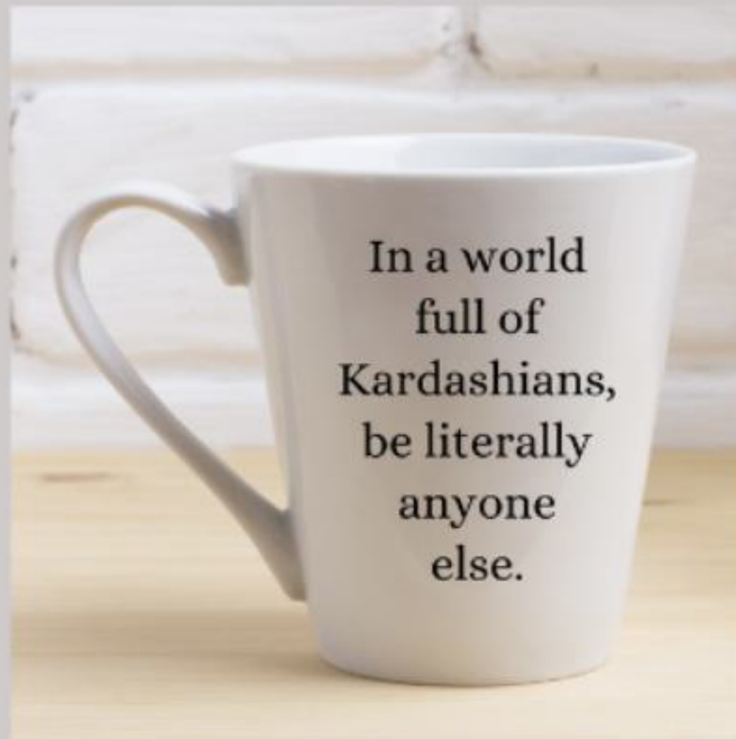
In a World Full of Kardashians MUG-021