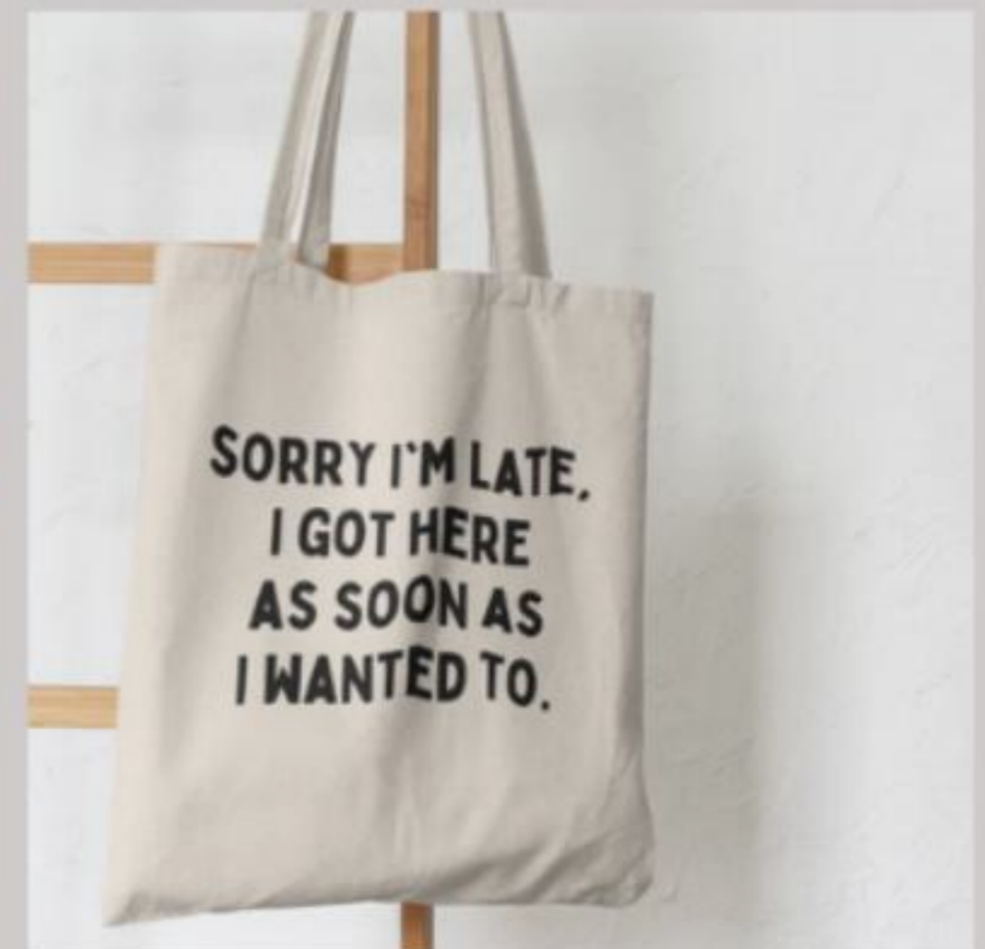
Sorry I'm Late SORRY