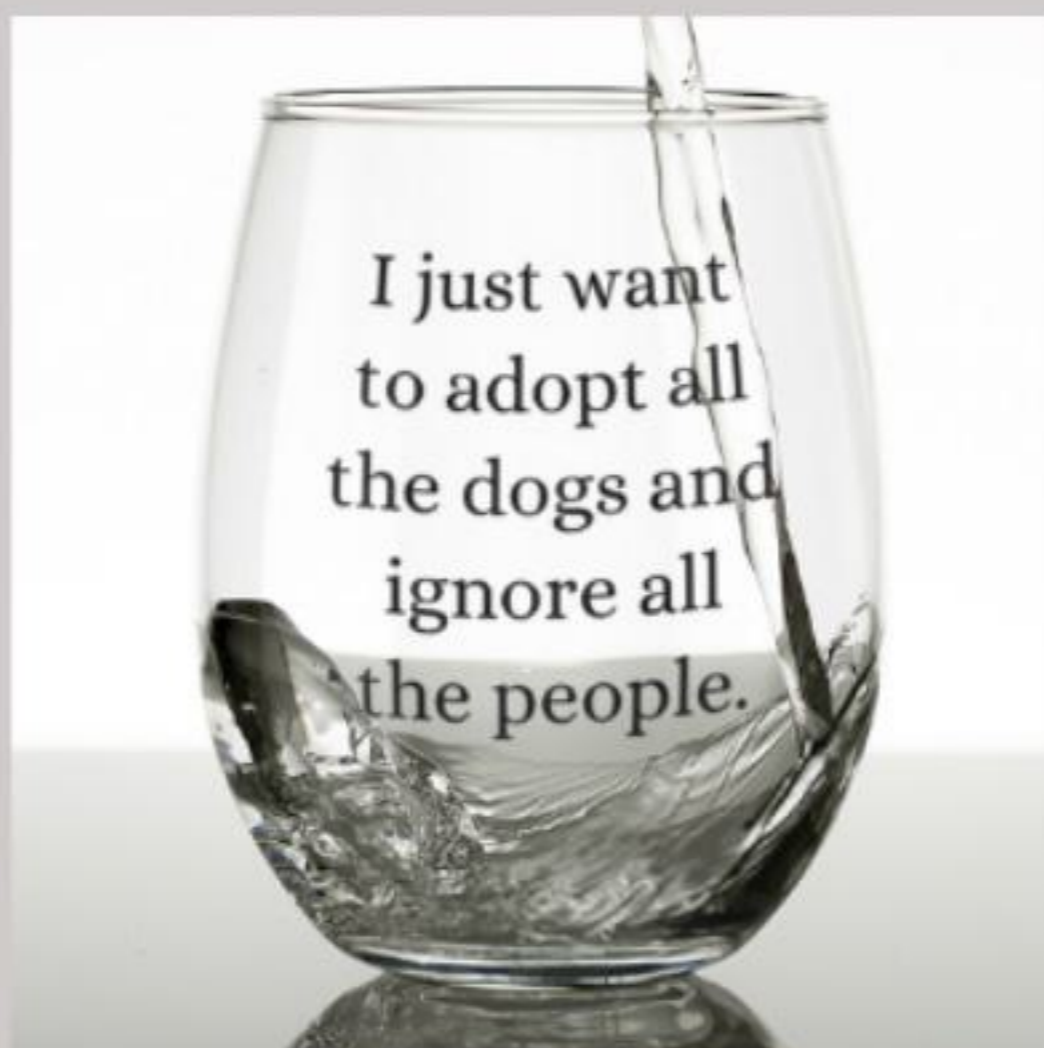
Adopt All the Dogs WINE-006