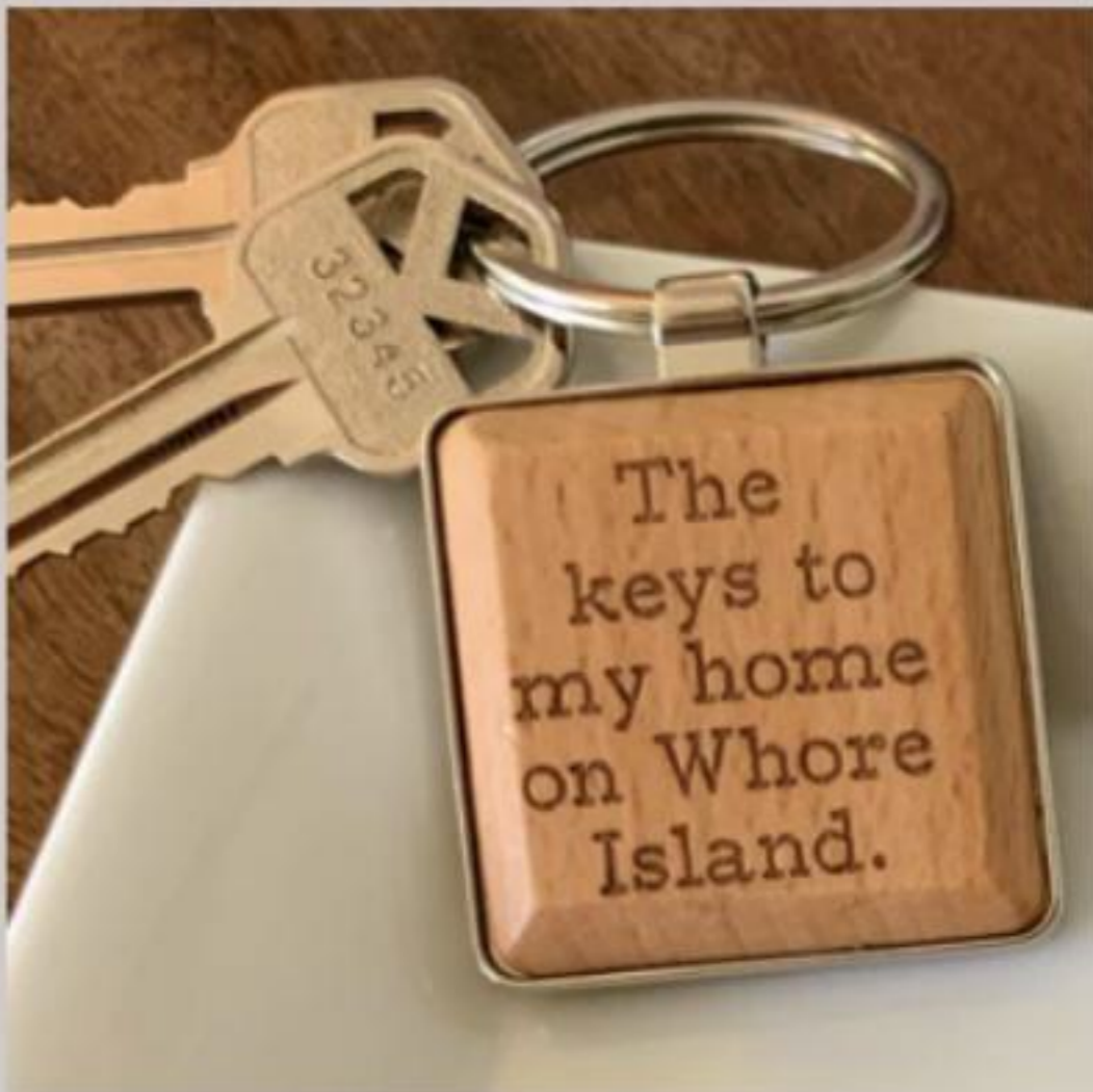
The Keys to My Home on Whore Island WHOREISLAND