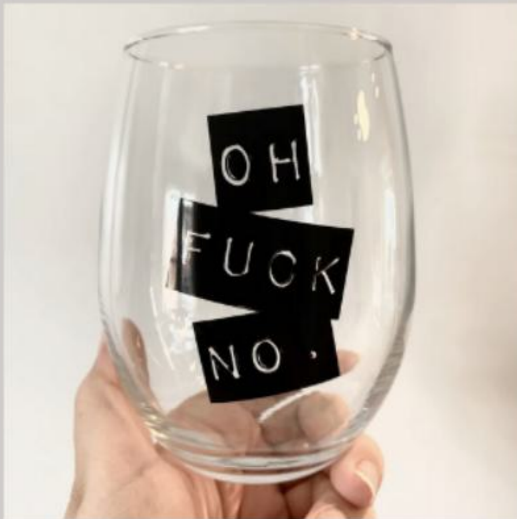
Oh Fuck No Wine-020