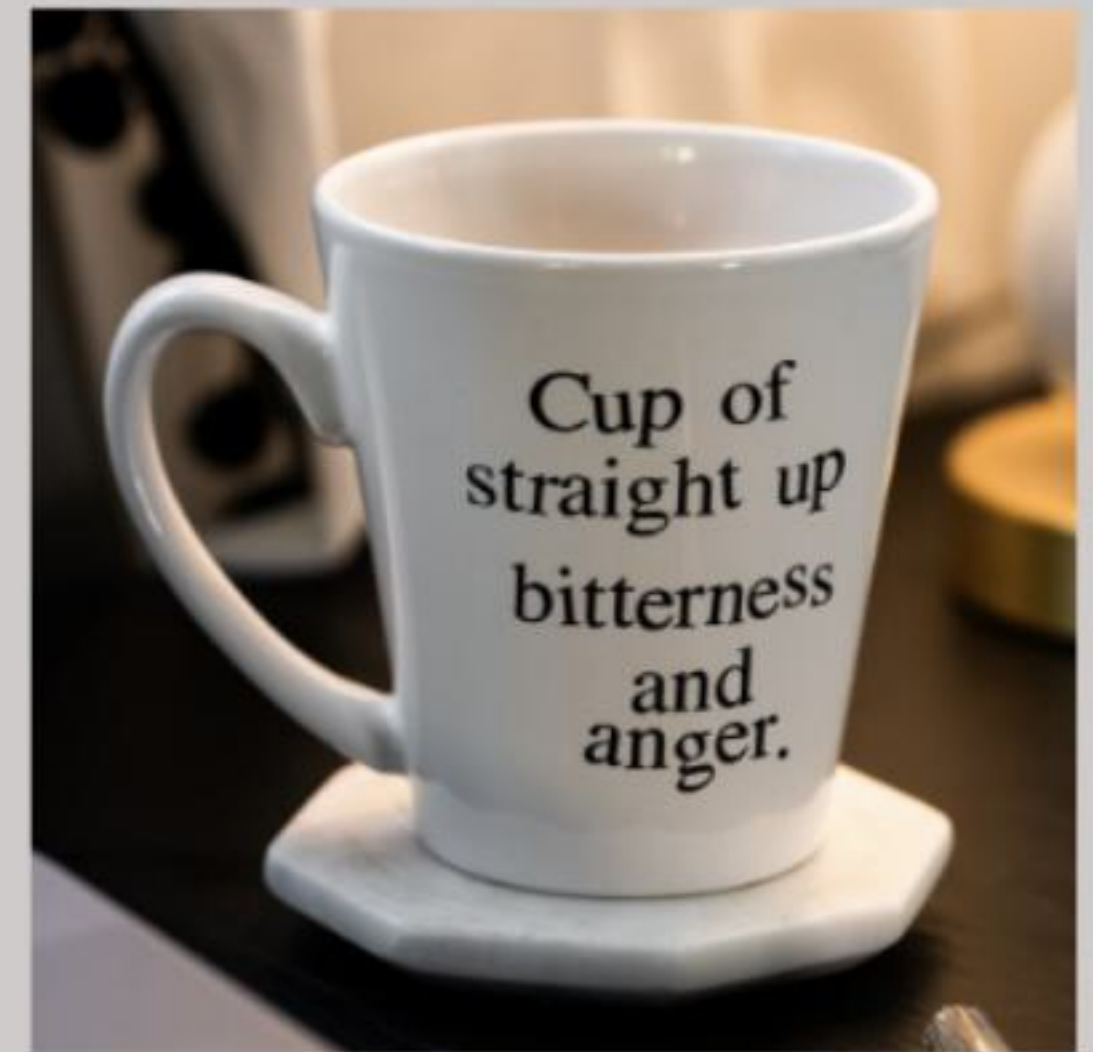
Bitterness and Anger MUG-008