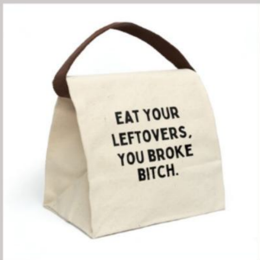
Eat Your Leftovers LEFTOVERS