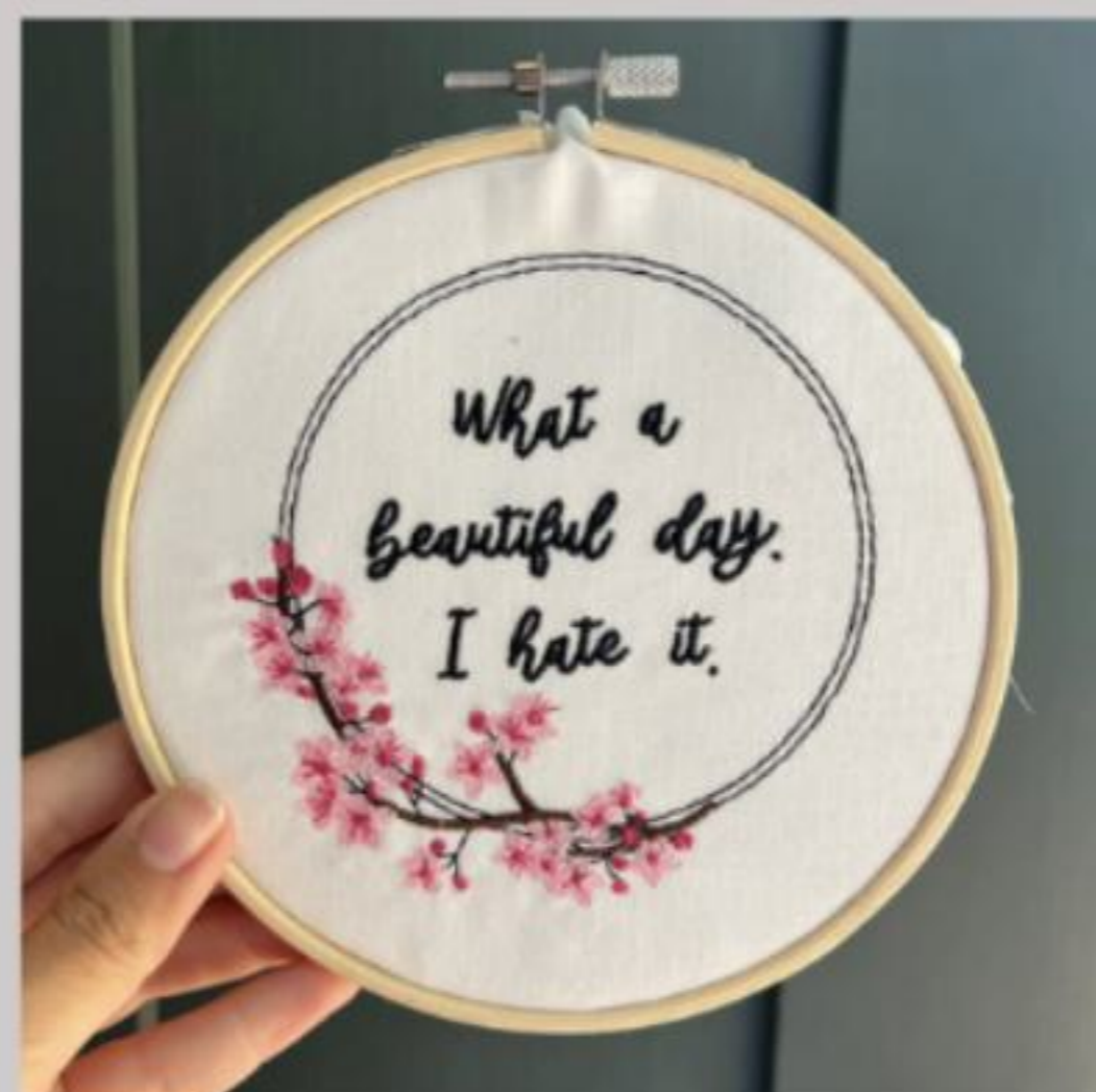
What a Beautiful Day CROSS-006