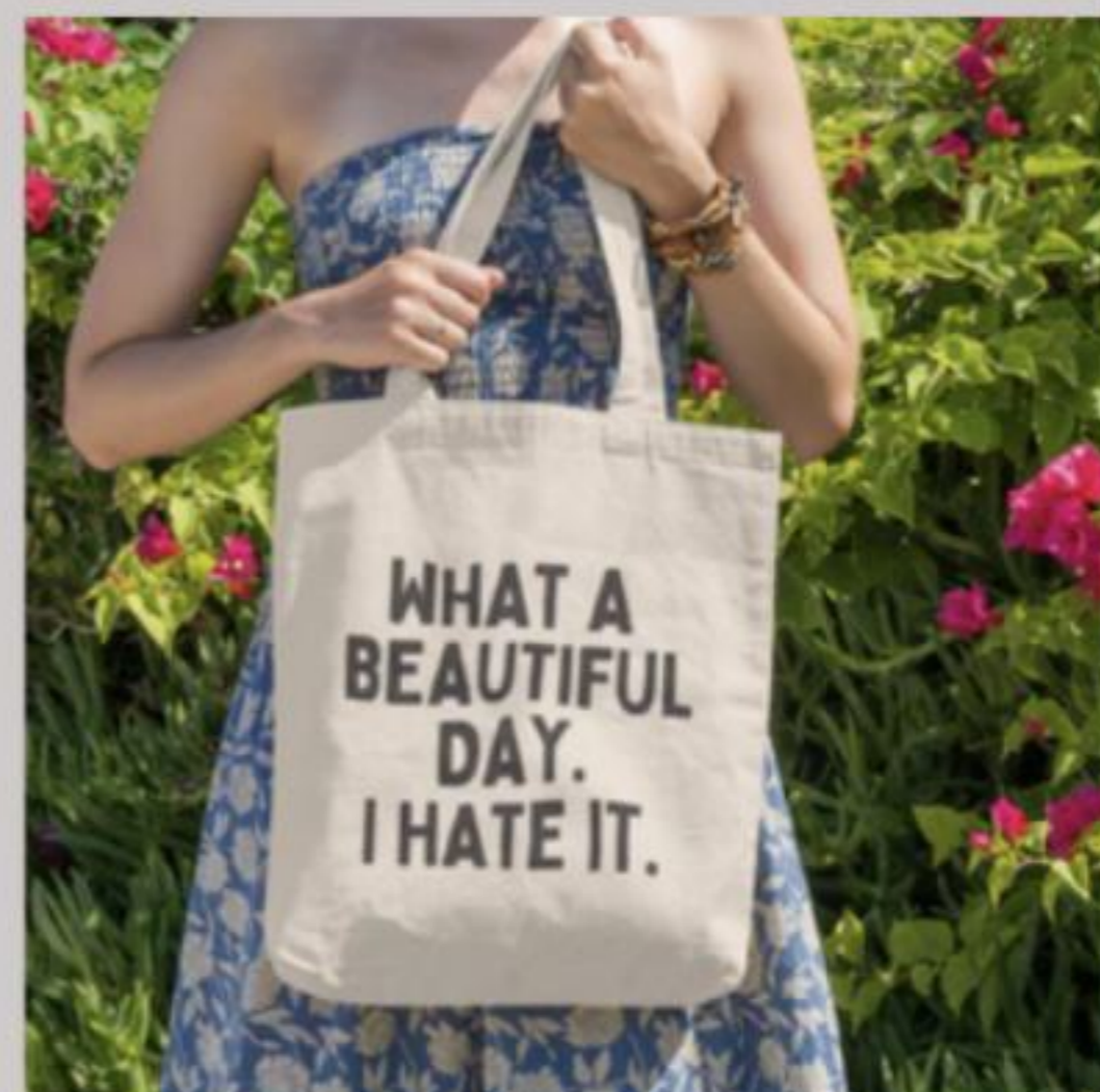
What a Beautiful Day BEAUTIFULDAY