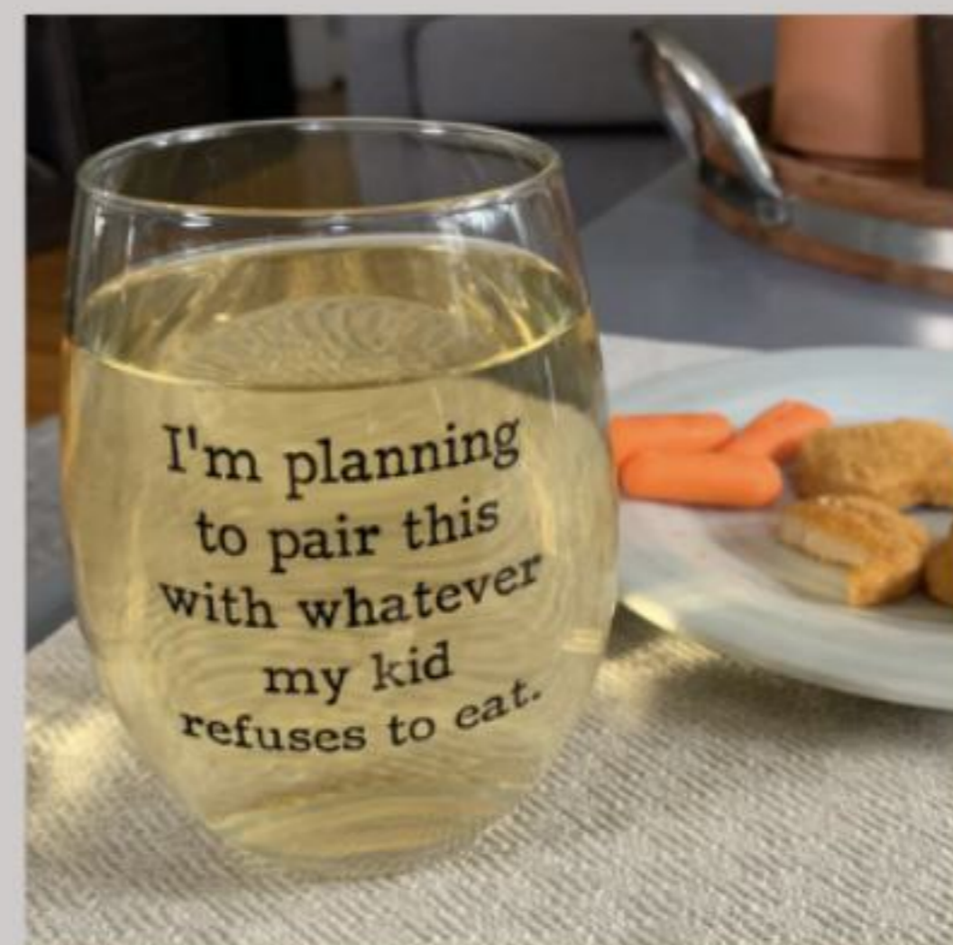
Planning to Pair This WINE-015