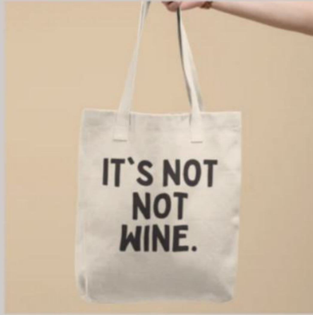
It's Not Not Wine NOTNOTWINE