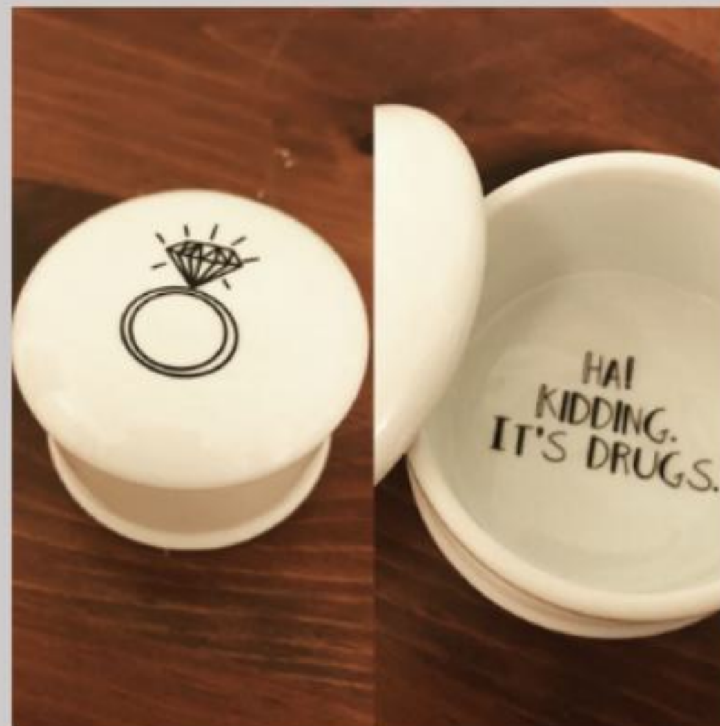
Surprise Stash Box BOX-001