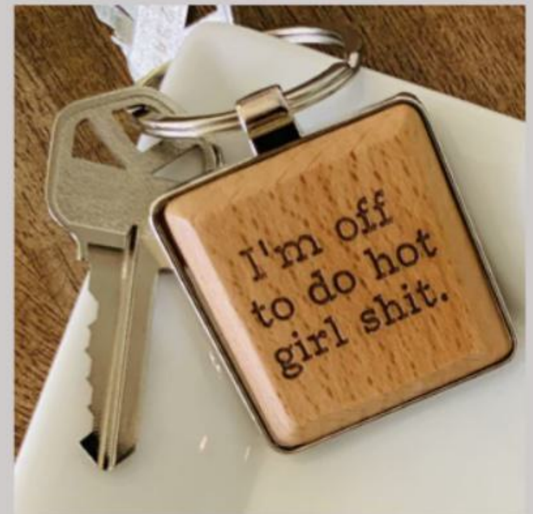
I'm Off to Do Hot Girl Shit HOTGIRL