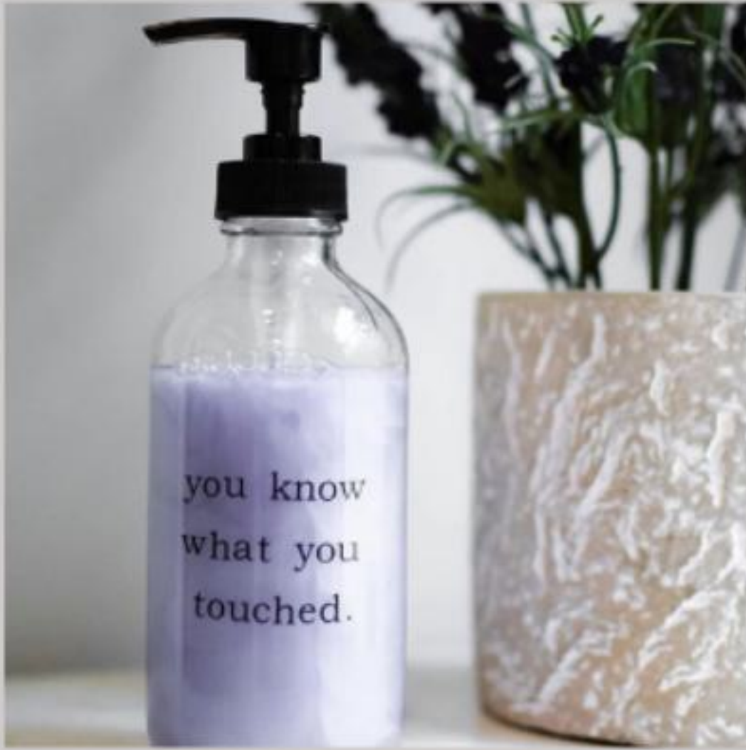
You Know What You Touched SOAP-002