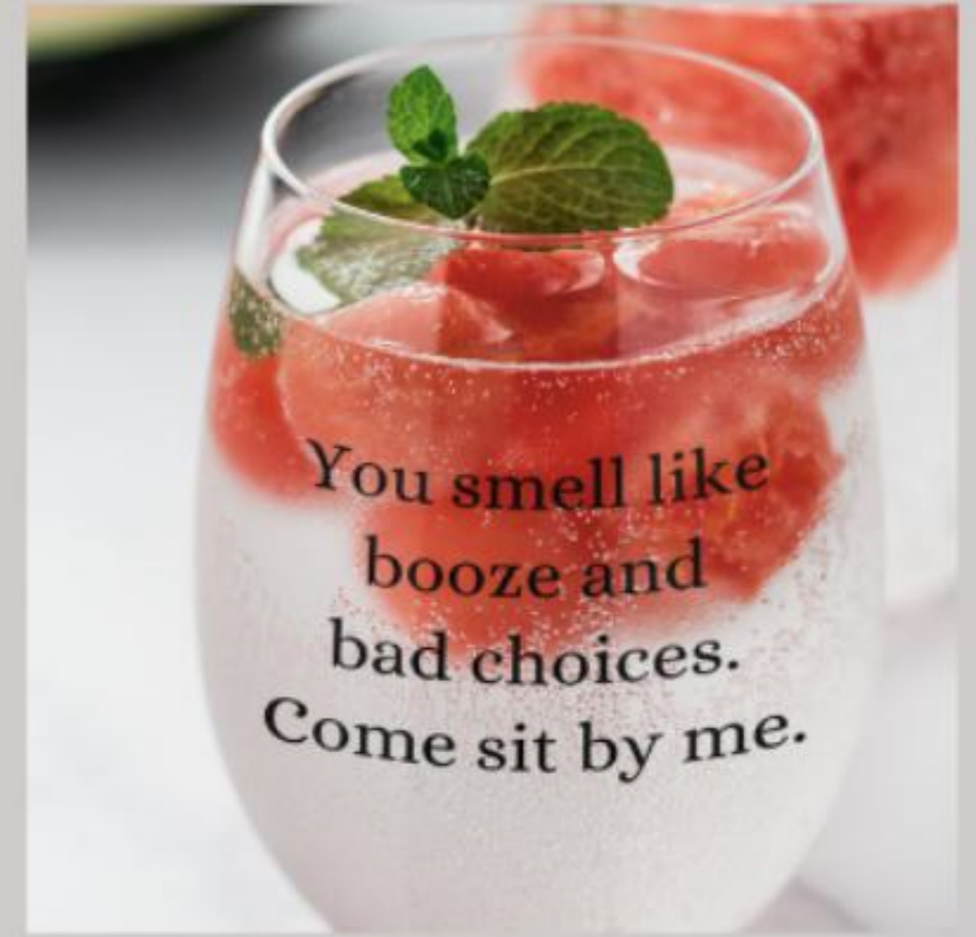
Booze and Bad Choices WINE-007