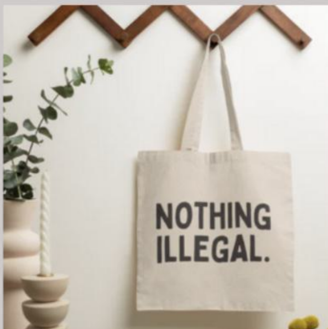
Nothing Illegal NOTHINGILLEGAL