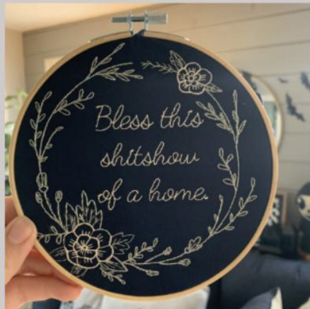
Bless this Shitshow CROSS-004