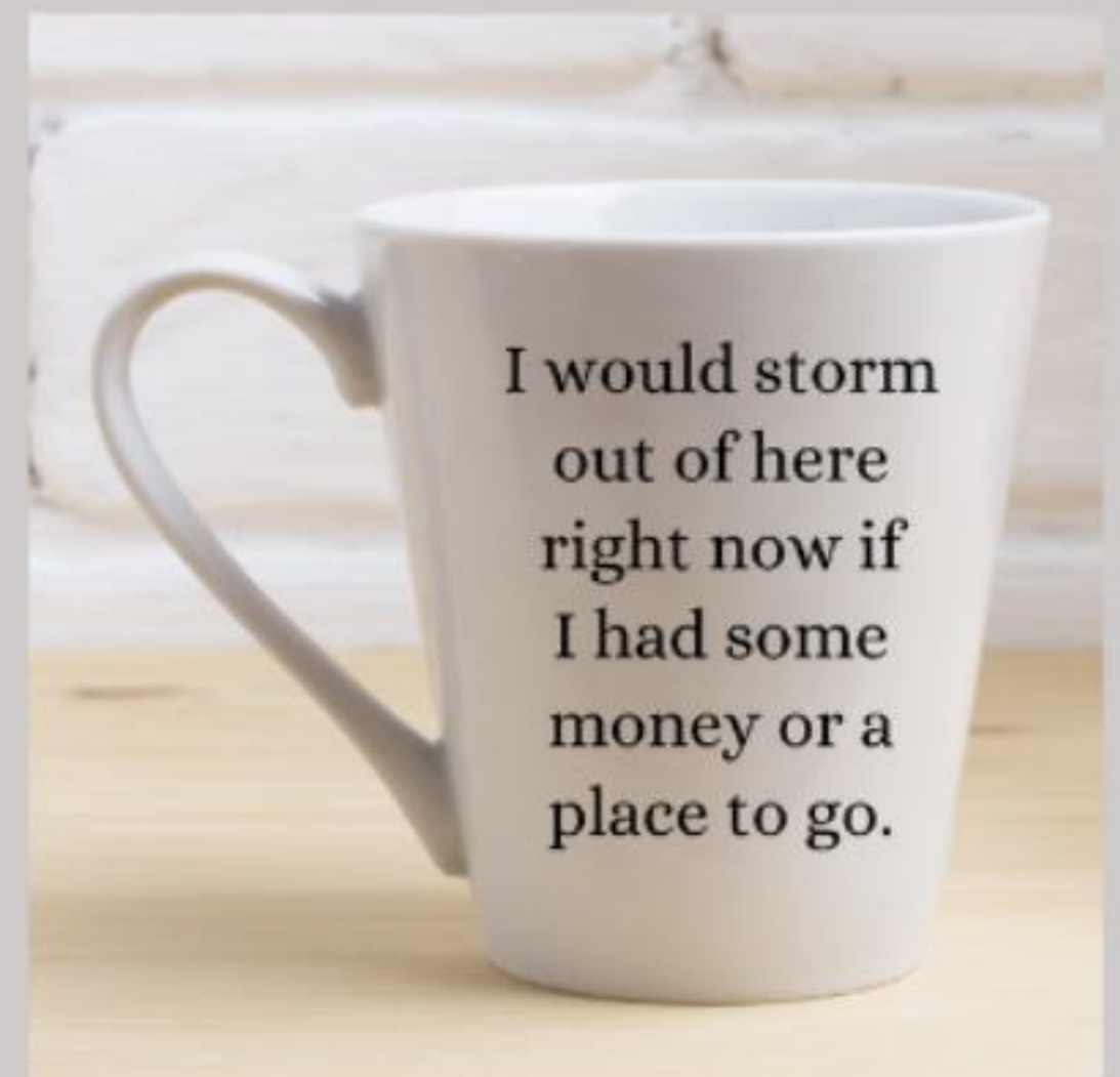
I Would Storm Out of Here MUG-071