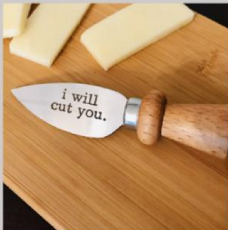
I Will Cut You KNIFE-002