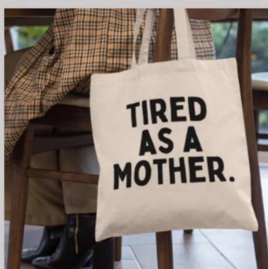
Tired as a Mother MOTHER