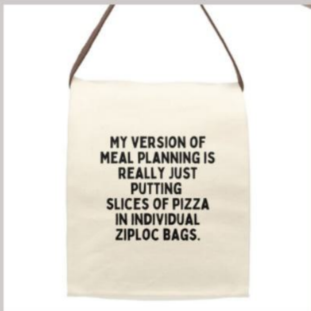
My Version of Meal Planning MEALPLANNING