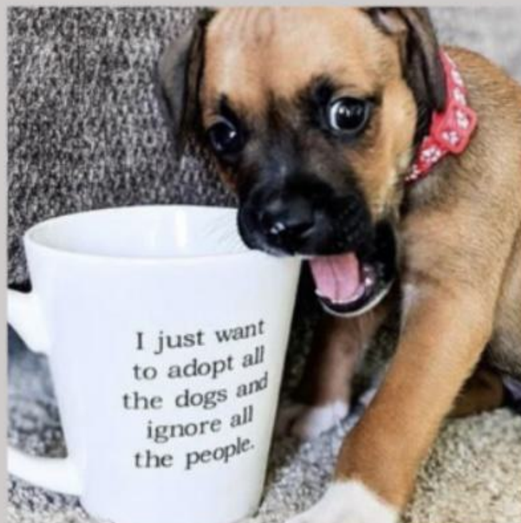
Adopt All the Dogs MUG-002