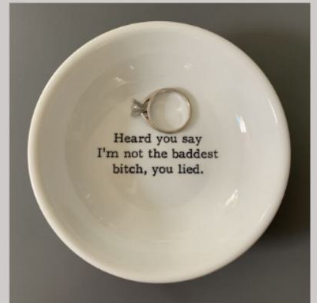
The Baddest Bitch TRINKET-002