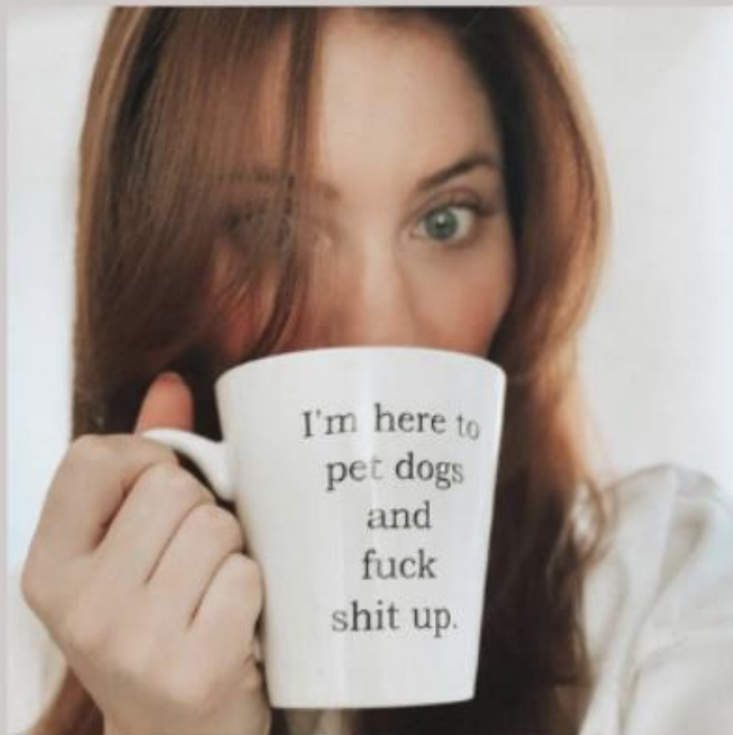
I'm Here to Pet Dogs MUG-073