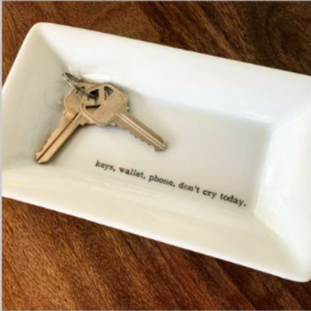
Keys, Wallet, Phone Don't Cry Today TRAY-001