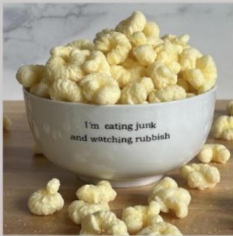
I'm Eating Junk and Watching Rubbish BOWL-003