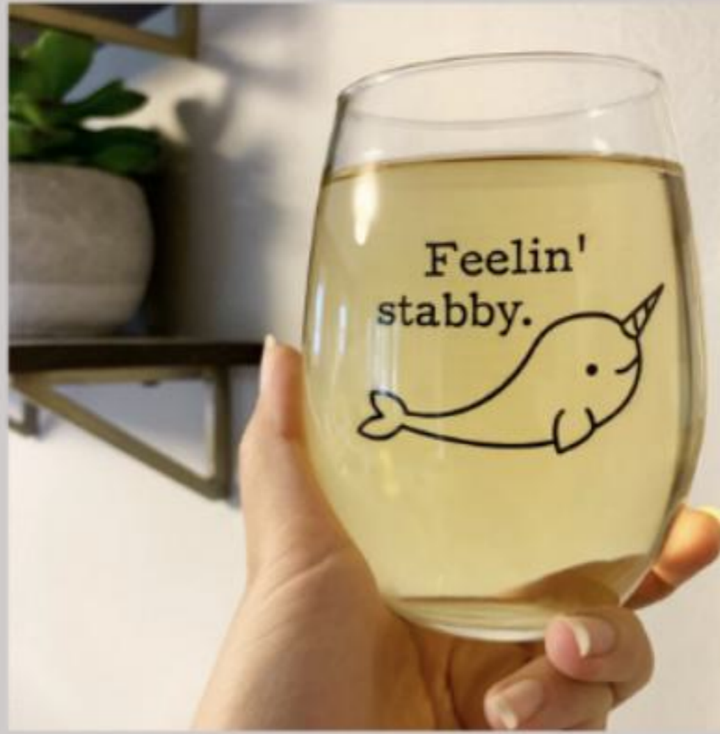
Feelin' Stabby WINE-013