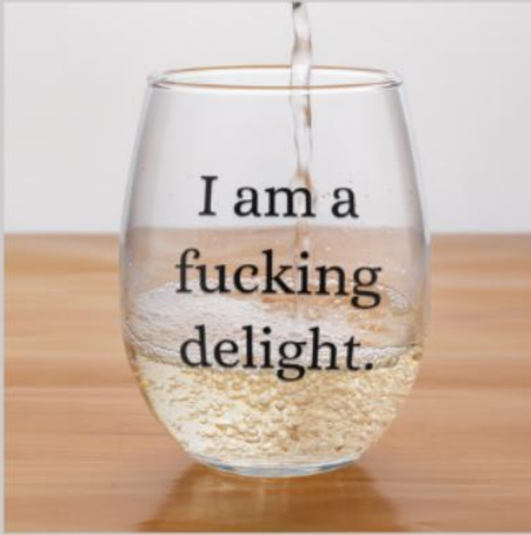
I Am a Fucking Delight WINE-009