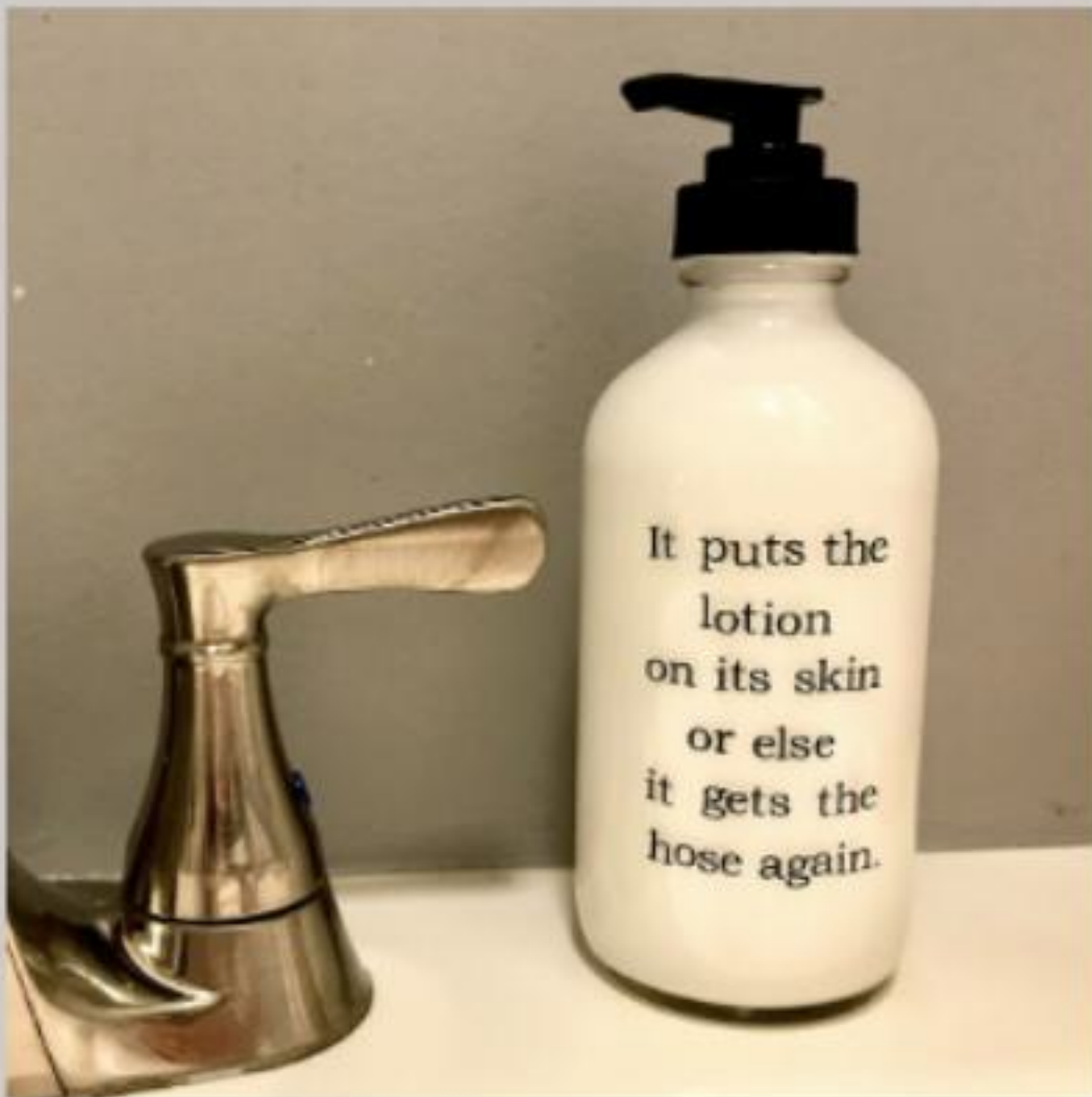
It Puts the Lotion on Its Skin LOTION-001