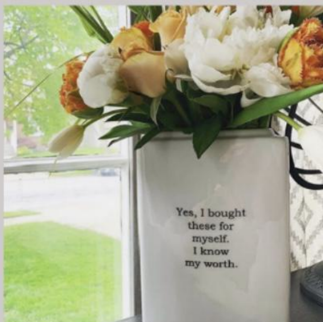
I Know My Worth Vase WORTH