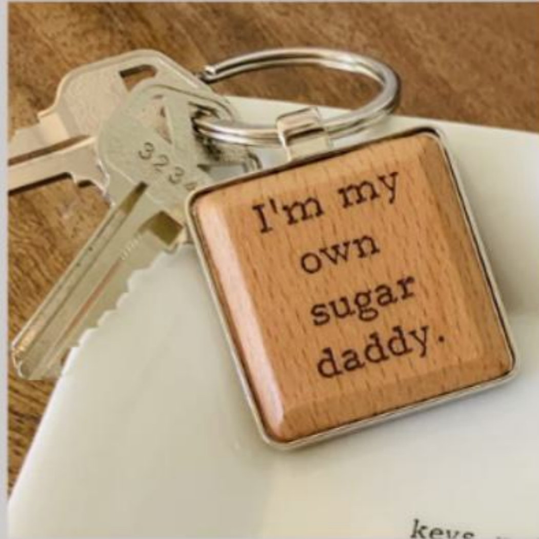
I'm My Own Sugar Daddy SUGARDADDY