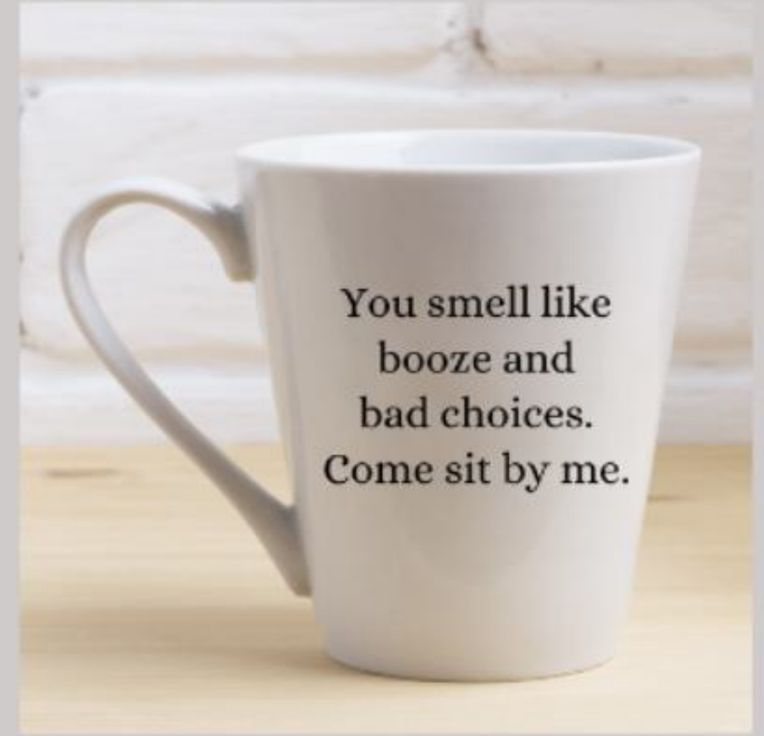
Booze and Bad Choices MUG-005