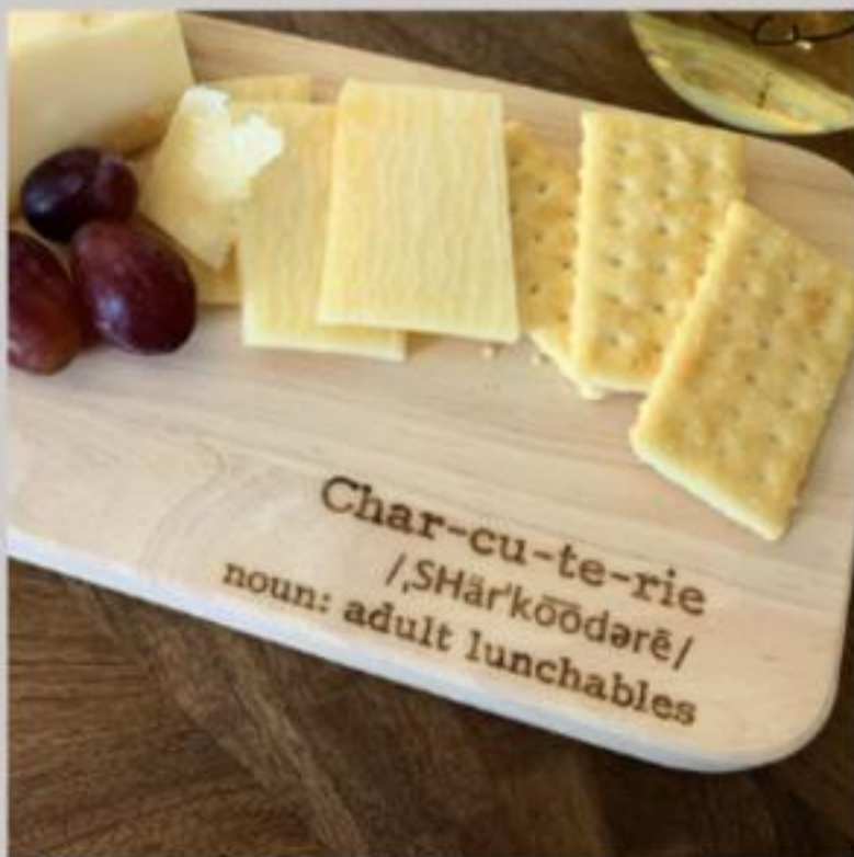
Adult Lunchables LUNCHABLES