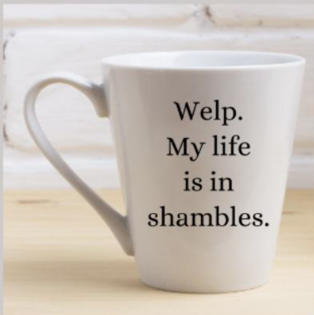
Welp My Life is in Shambles MUG-049