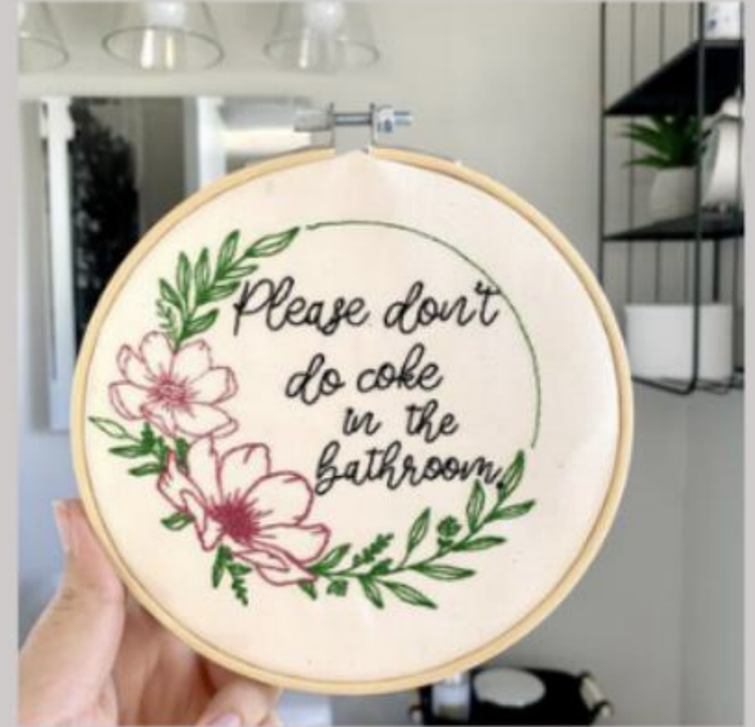
Please Don't Do Coke in the Bathroom CROSS-001