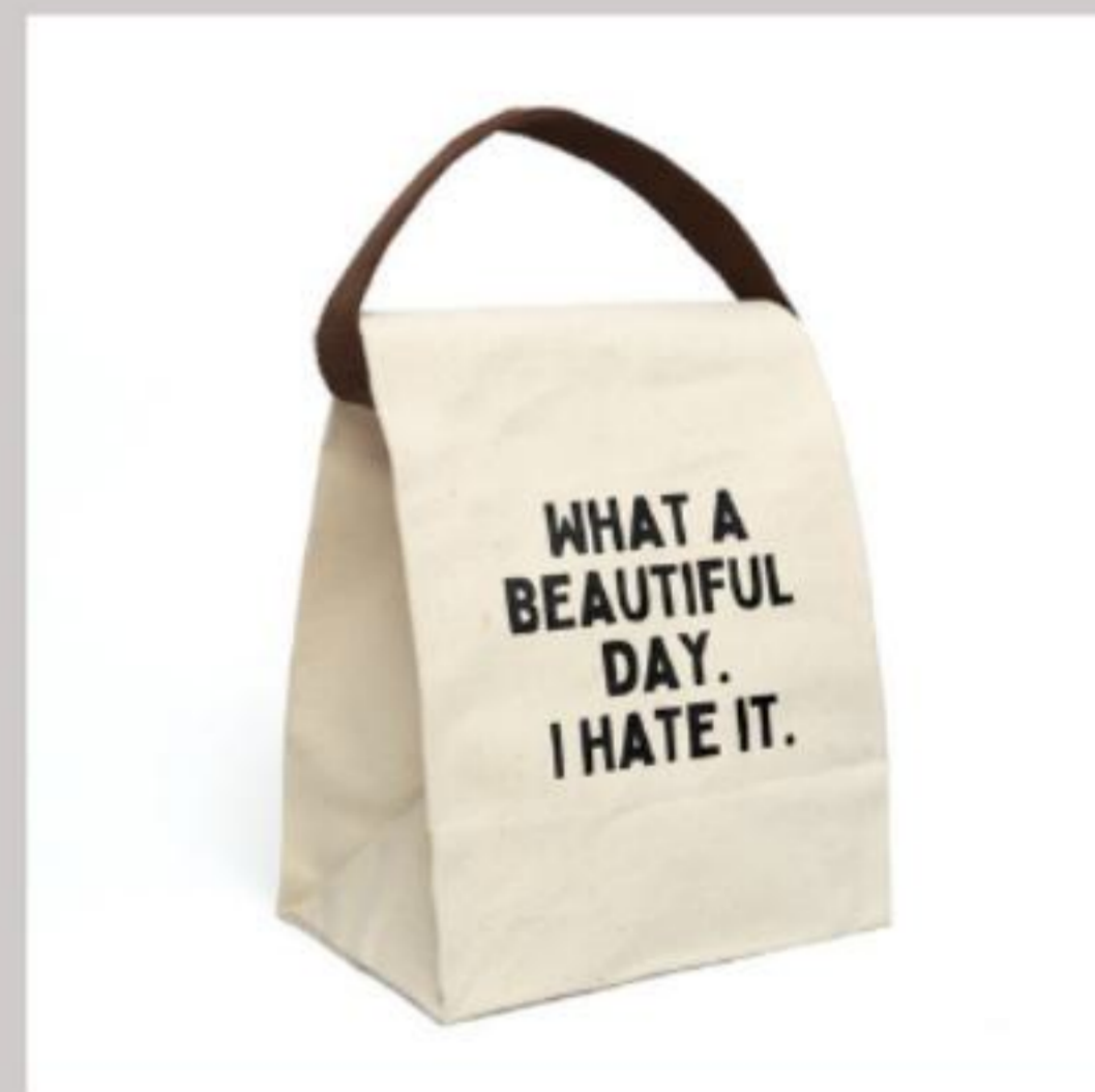
What a Beautiful Day BEAUTIFUL