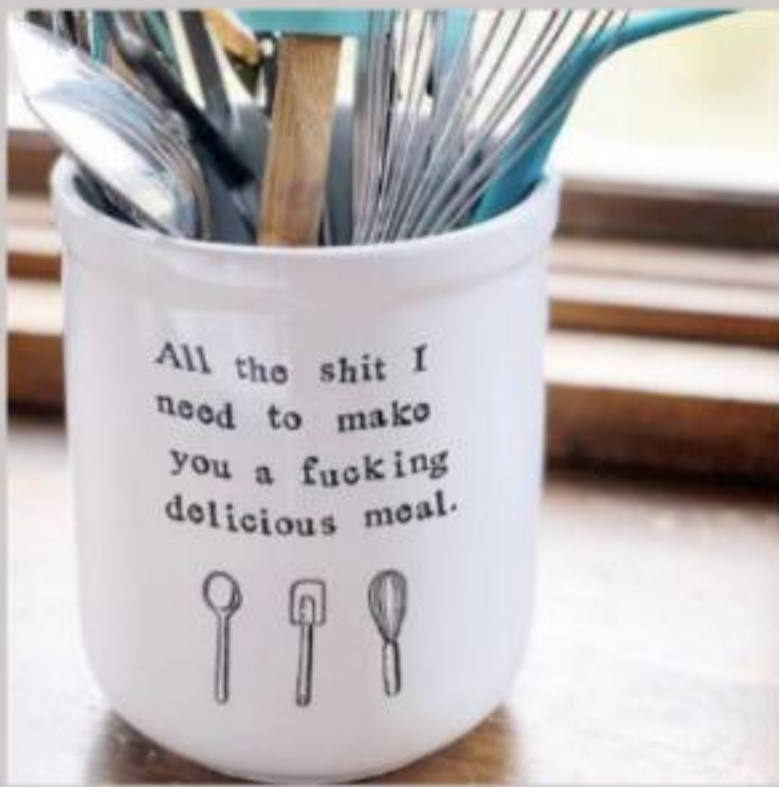
Utensil Crock UTENSIL-001