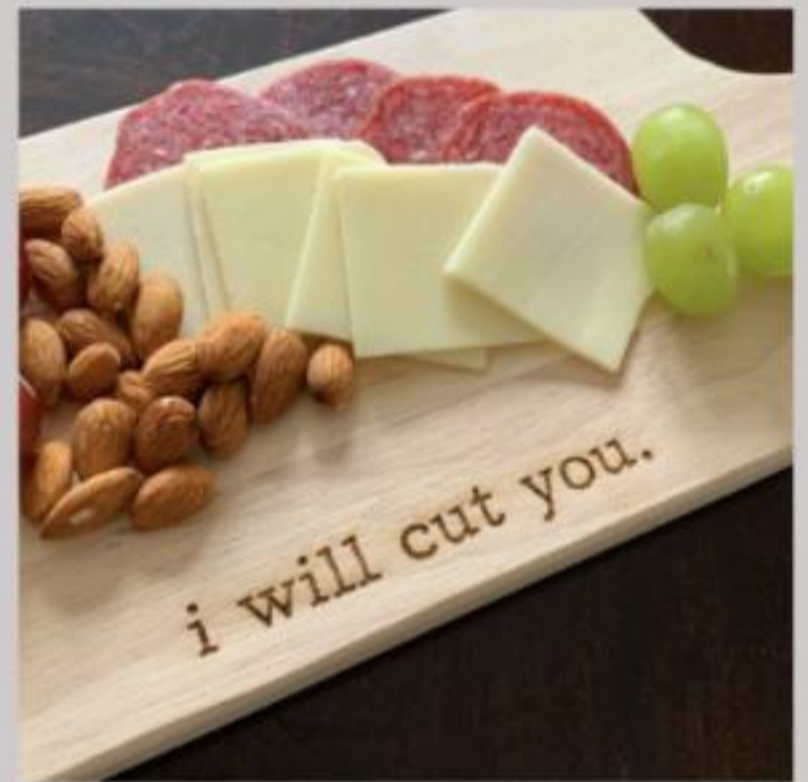
I Will Cut You CUTTINGBOARD-001