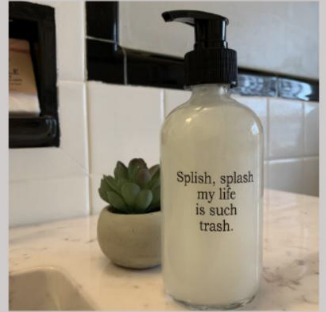
Splish Splash My Life is Such Trash SOAP-003