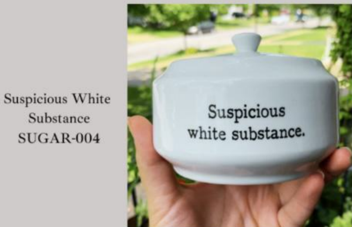
Suspicious White Substance SUGAR-004