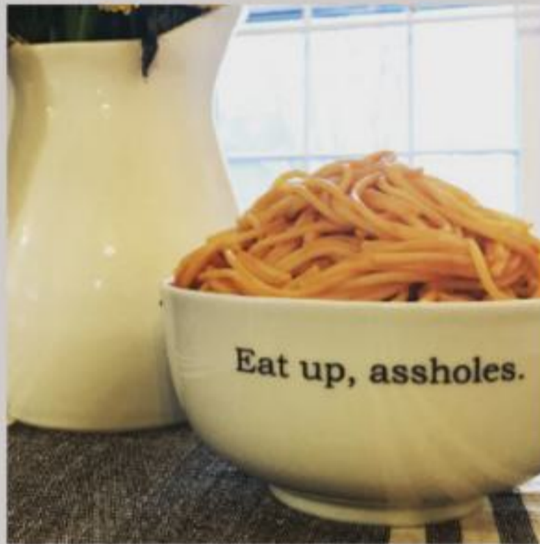
Eat Up, Assholes BOWL-011