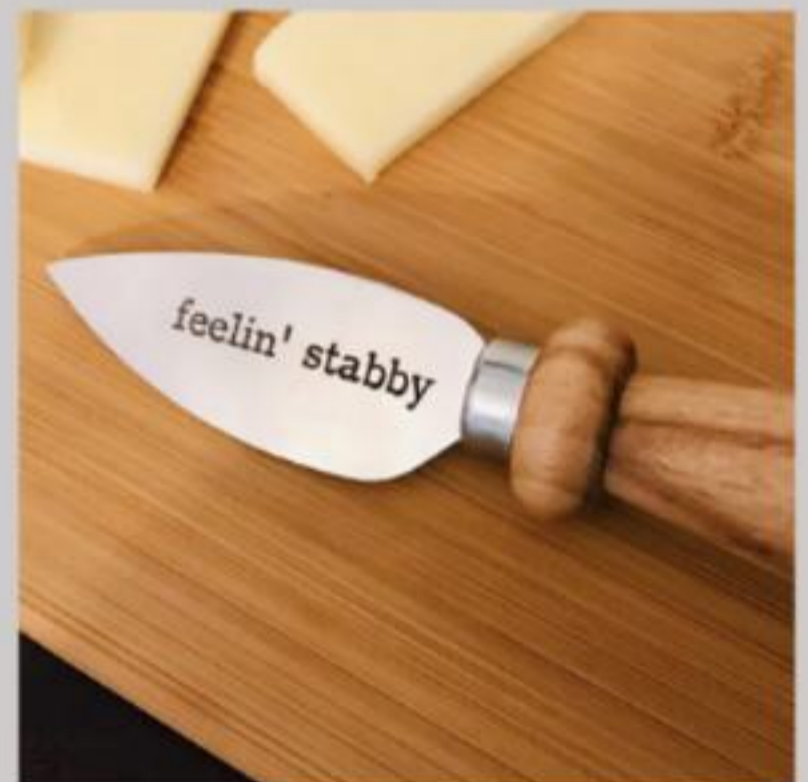
Feelin' Stabby KNIFE-003