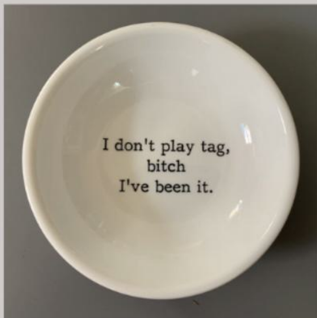
I Don't Play Tag TRINKET-005