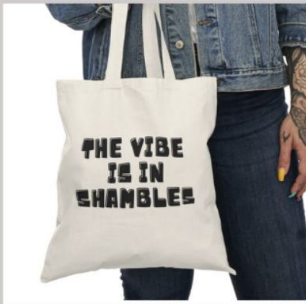
The Vibe is in Shambles SHAMBLES