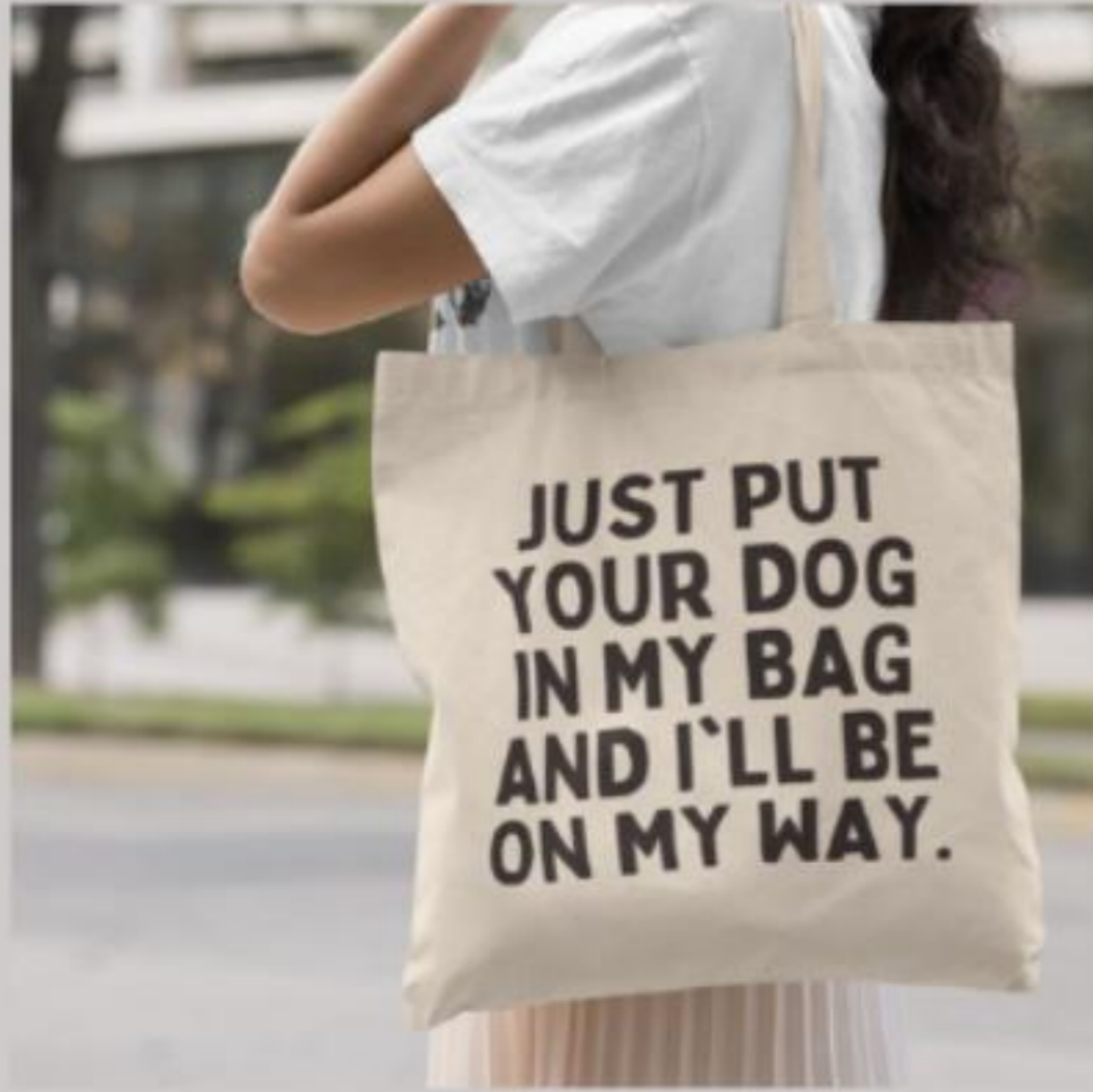
Dognapping Tote DOGNAPPING