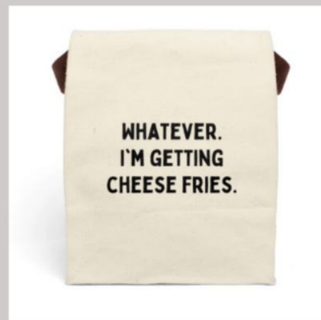
Whatever I'm Getting Cheese Fries CHEESEFRIES