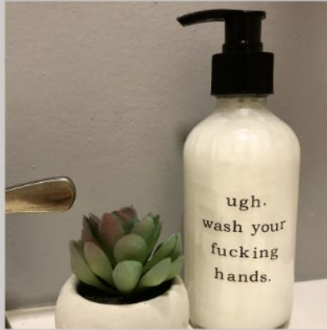
Ugh Wash Your Fucking Hands SOAP-001