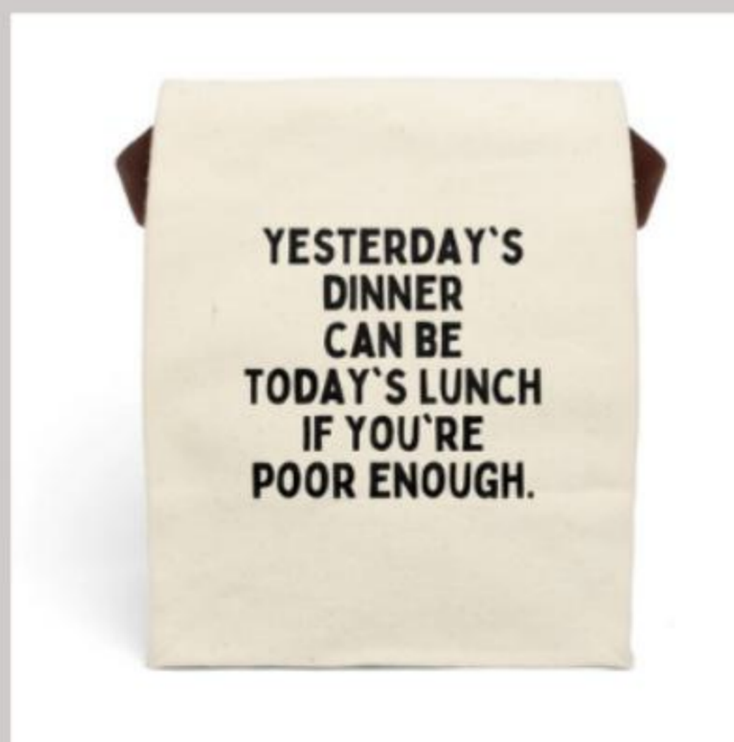
Yesterday's Dinner YESTERDAY