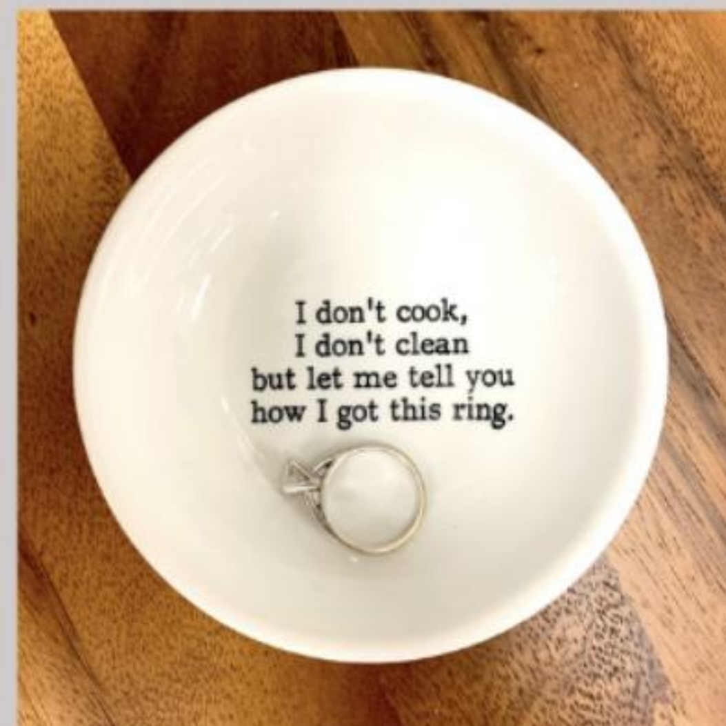
Don't Cook, Don't Clean TRINKET-006