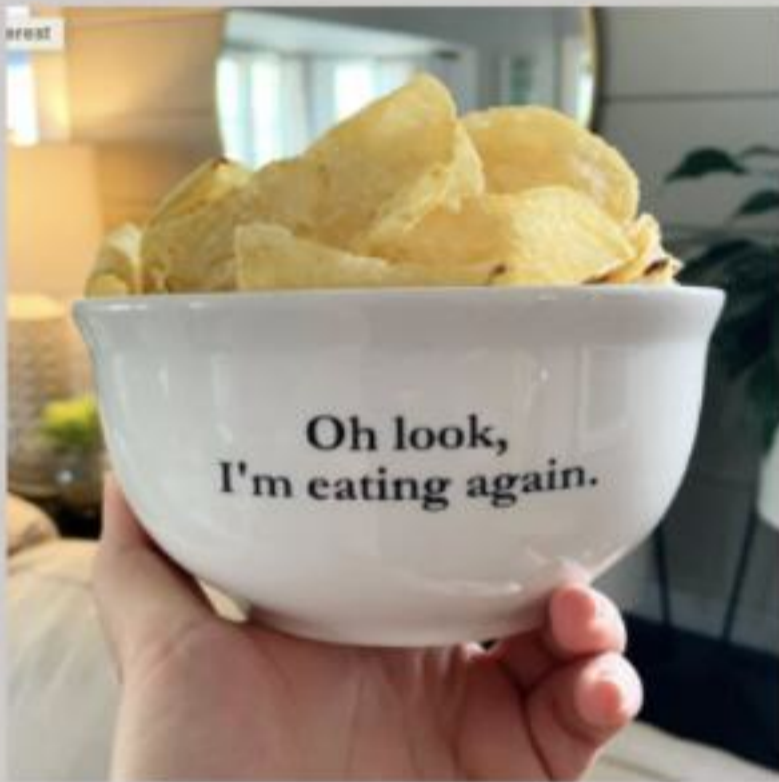
Oh Look, I'm Eating Again BOWL-012