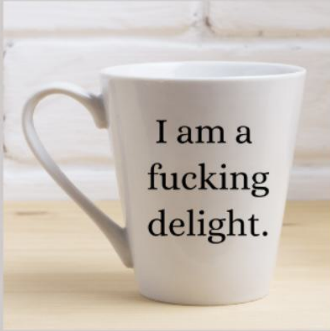
I Am a Fucking Delight MUG-017