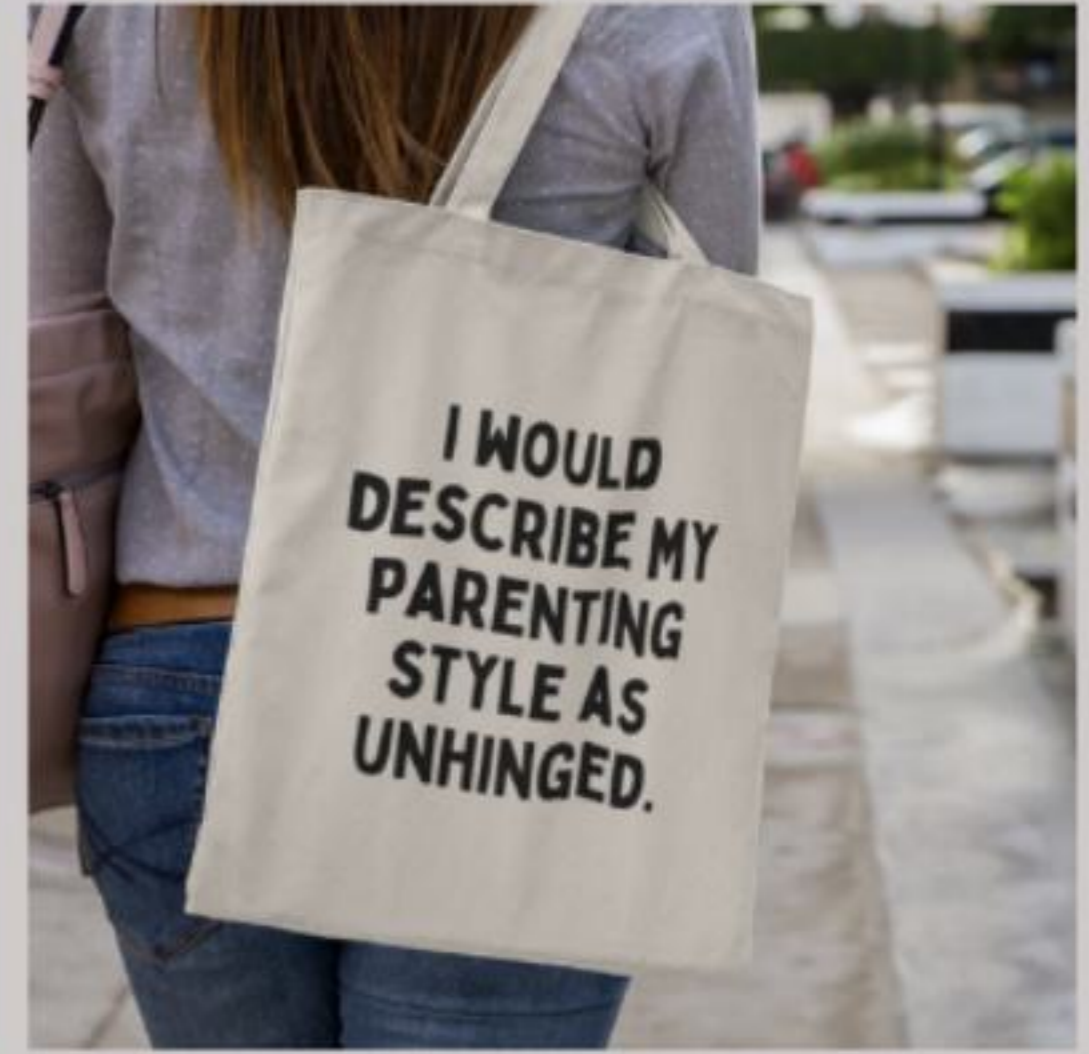
Unhinged Parenting UNHINGED