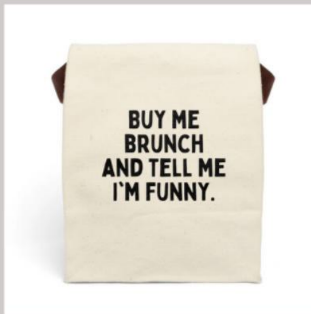
Buy Me Brunch BRUNCH