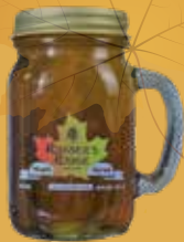
Glass Mason Jar